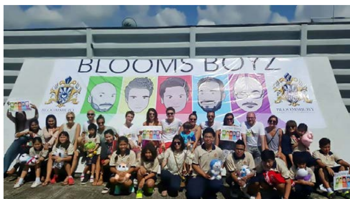
Staff and Students on Children's Day

Students from Bloomsbury were invited to join the Children's Day Celebrations at Airbase 56 in Hat Yai on Saturday. The students performed a dance and the Blooms Boyz enjoyed performing two songs.