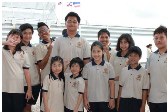
Students danced at Airbase 56

Students from Bloomsbury were invited to join the Children's Day Celebrations at Airbase 56 in Hat Yai on Saturday. The students performed a dance and the Blooms Boyz enjoyed performing two songs.