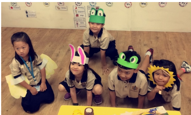
Assembly production by Year 1

Year 1 has been learning to differentiate between stories, poems, and plays. Here, they are rehearsing a short play called "The Ker-PLUNK" with Year 2. Together they performed the entertaining story to the whole school last week in assembly.