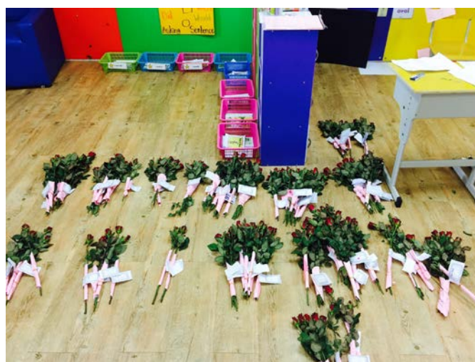
Prepared for delivery

Charity allows us to give freely without expecting anything in return. We are very proud of the students who raised 4490 THB for charity.