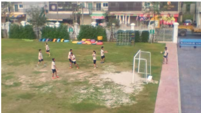
KS3 and KS4 playing football

The students really loved meeting the turtles (pictured above) and insisted he kept them at the school from now on!