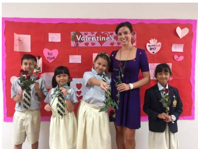
4490 THB was raised for charity

Students at Bloomsbury prepared and delivered the flowers during the morning lessons, bringing smiles to the students and staff that lasted longer than the day!