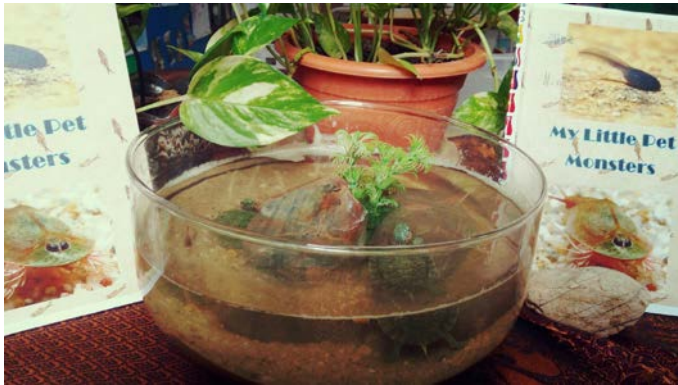
My Little Monster ECA

Art Exam Tues 4 - Wed 5 April ICT Practical Tue 25 & Thurs 27 April