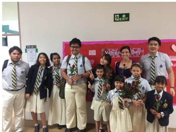
Students sold roses to raise money

Bloomsbury celebrated Valentine's Day with a charity fundraiser. Students and teachers were able to buy roses to send to their valentines.