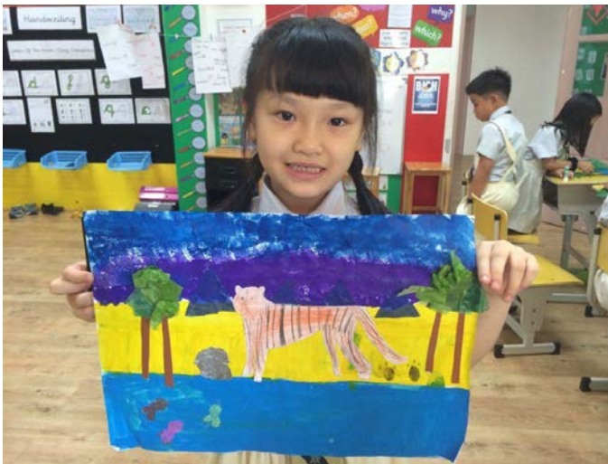
Year 2 created book covers in Art in a cross-over with their English lessons.