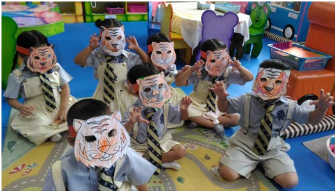
Pre Primary in their majestic tiger masks