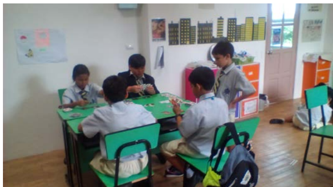
Card Club ECA

Our students demonstrated the virtue of charity by being generous with their presence, time and money.