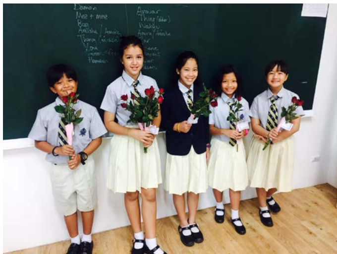
Valentine's Day Roses

Bloomsbury celebrated Valentine's Day with a charity fundraiser. Students and teachers were able to buy roses to send to their valentines.